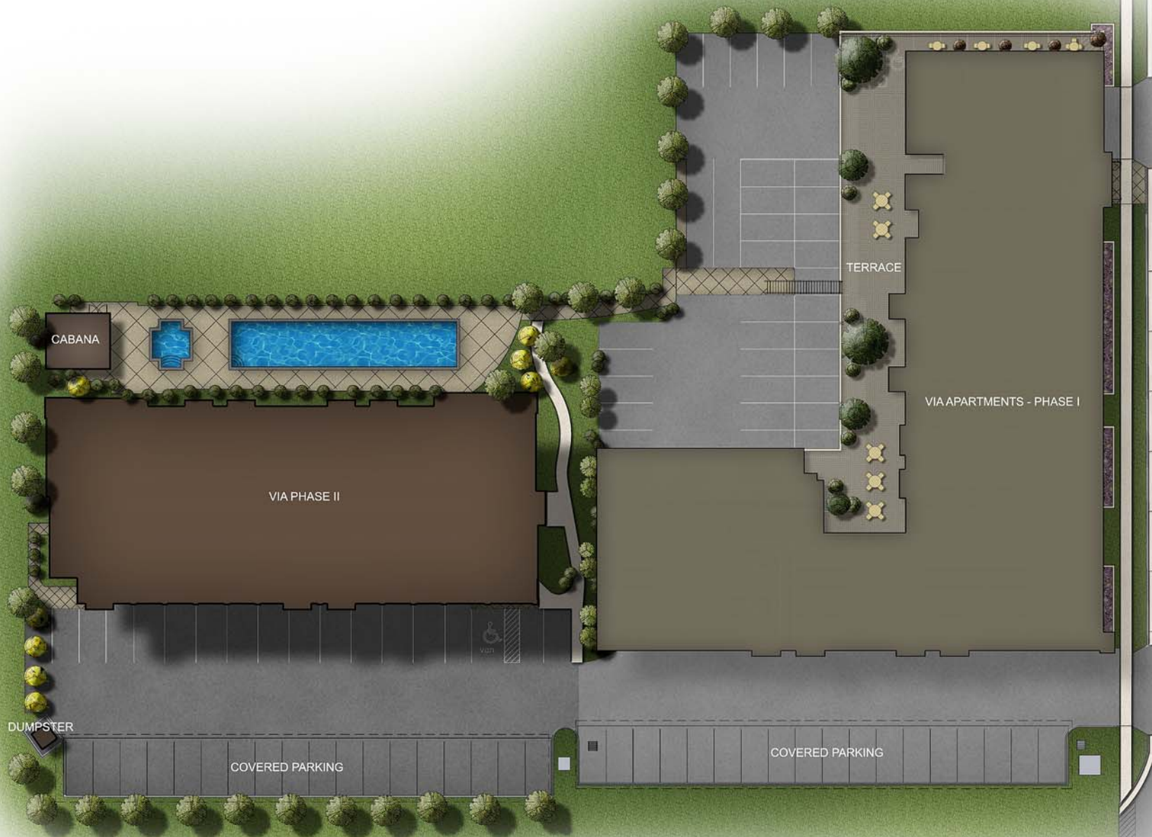
VIA APARTMENTS - PHASE II